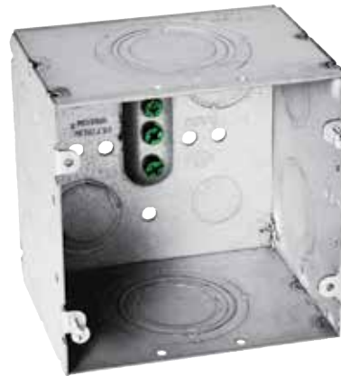
HBL260 Large Capacity Wall Box (66.7 cu. in.)