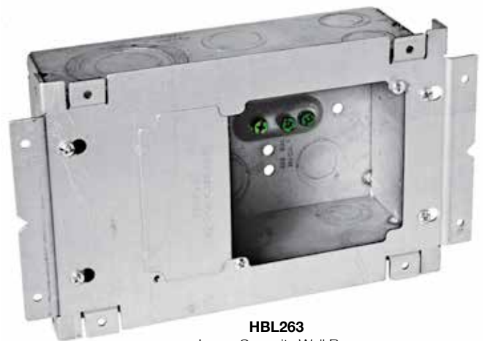
HBL263 Large Capacity Wall Box (113.3 cu. in.)