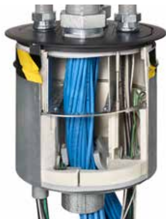
Step 7 Install AV. Two 2" liquid-tight fittings and conduit can be used.