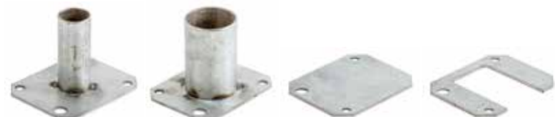
Perimeter feed bottom plates

Note: *Data/AV wiring only. **Not approved for use in the City of Chicago.