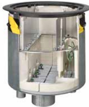
Step 2 Low voltage dividers and flange are installed on to FRPT.