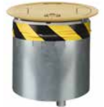
10" fitting with brass cover