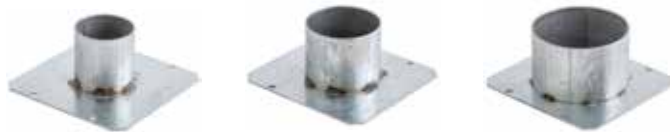
2 gang center feed bottom plates