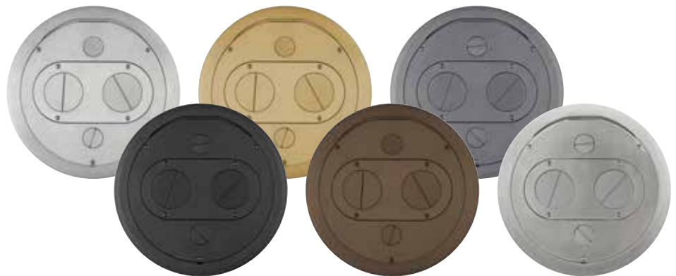
Hubbell SystemOne 10" furniture feed covers are available in all six architectural finishes to complement any decor.