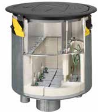
Step 3 Main cover and secondary cover are installed.