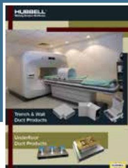
Trench, Wall and Underfloor Duct Products