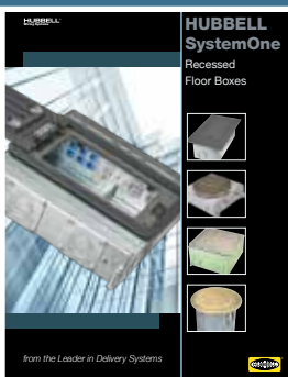
Hubbell SystemOne Recessed Floor Boxes