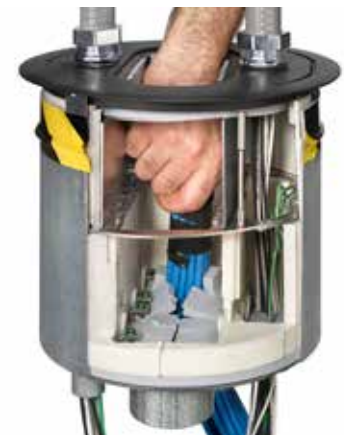
Step 6 Large cover opening allows for easy AV installation. Up to two 2 1/2" bottom feed plates can be installed.