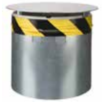
10" fitting with installation cover