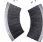
Egress door brushes