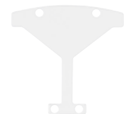
Perimeter device bracket