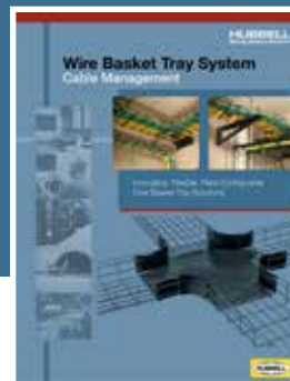
Wire Basket Tray Systems