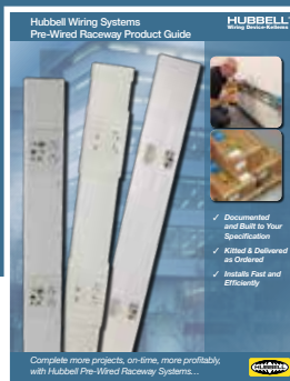
Pre-Wired Raceway Product Guide