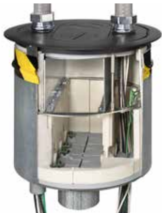
Step 4 Line voltage installed into outer perimeter chambers. Two 3/4" or 1" liquid-tight fittings and conduit can be used.