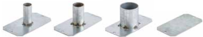
1 gang center feed bottom plates