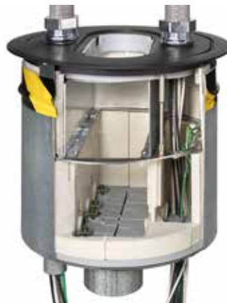
Step 5 Secondary low voltage cover is removed. Low voltage dividers limit access to center chamber.