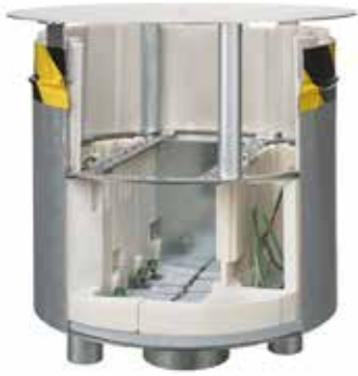
Step 1 10" FRPT is installed. Installation cover and spacer are removed.

The Hubbell SystemOne 10" Fire-Rated Poke-Through (FRPT) furniture feed covers and fittings provide the largest service capacity. The dividing system isolates line voltage and AV during installation.