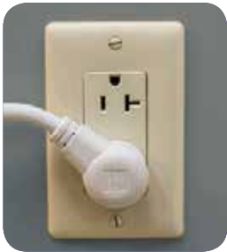
45° Angle Plug (15A only)