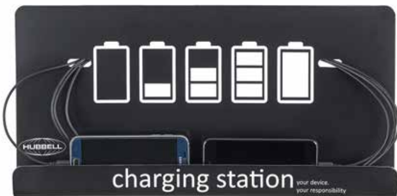
Wall Unit Shown with Standard Design