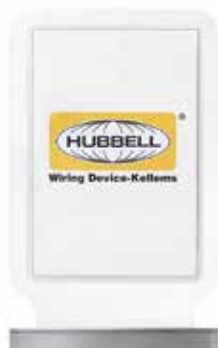
HCPWRPED52LKGRYxxx - Example - Custom Light Kit Graphics