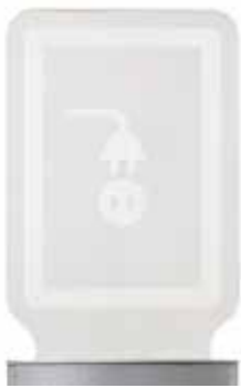
HCPWRPED52LKGRY Standard Light Kit