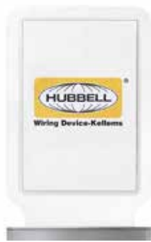
HCPWRPED52LKGRYxxx - Example - Custom Light Kit Graphics