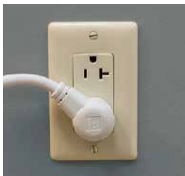
45° Angle Plug