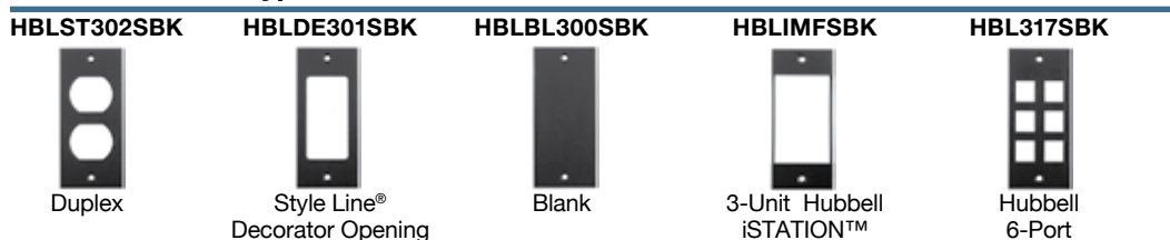
Table Top Boxes