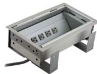
WSBG43UBAL (Cover doors shown open)