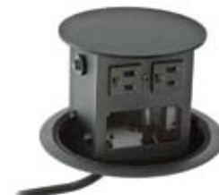
WSBH42U with WSBHTRBK