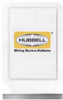
HCPWRPED52LKGRYxxx - Example - Custom Light Kit Graphics