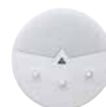
WLDH Wireless Daylight Sensor