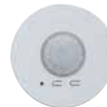
WLP450C Wireless Ceiling Sensor